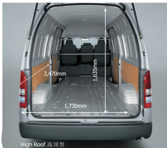
High Roof 高顶型