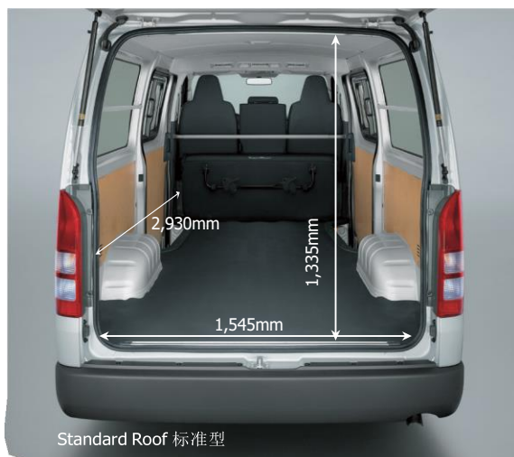
Standard Roof 标准型